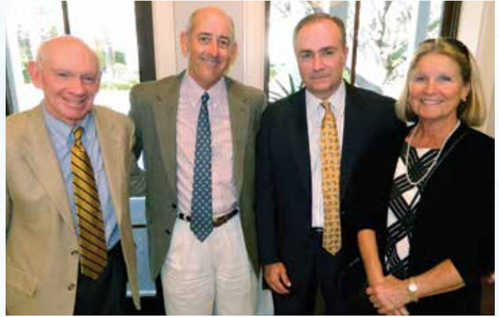
Founders / Fund Holders / Friends Event, March