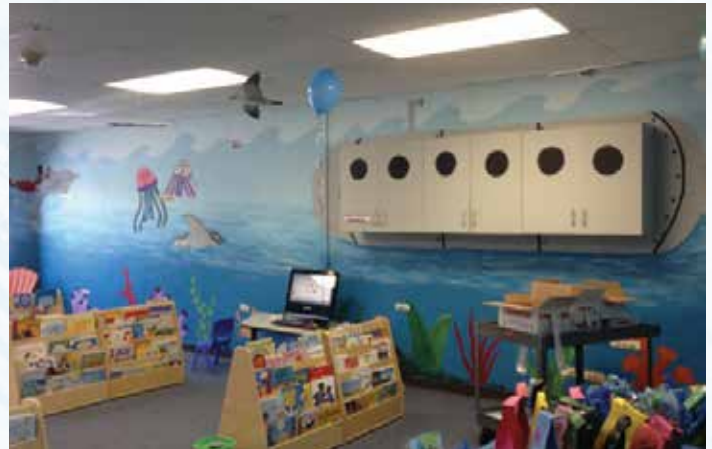
Baby Steps Reading Centers Dedicated, April & June