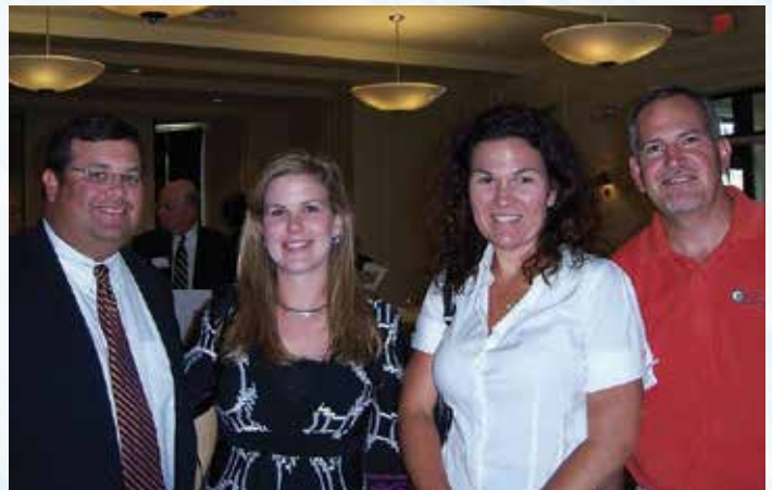
Professional Advisor Luncheons, April, July, August